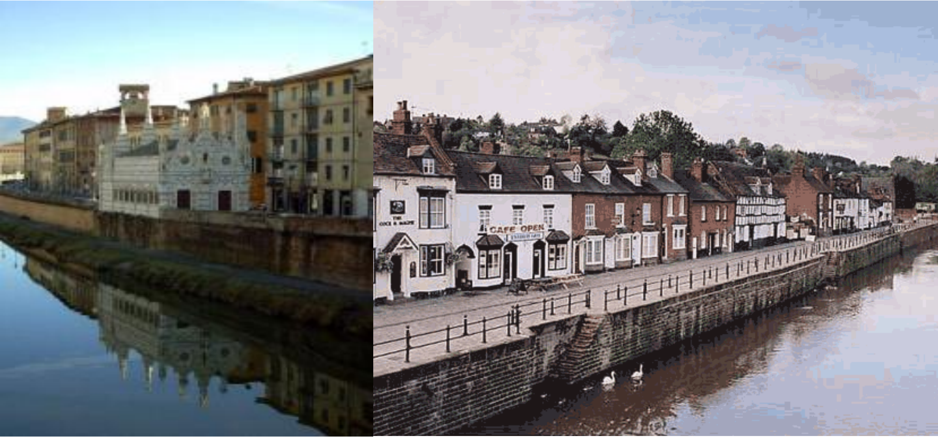
Concrete River Barriers